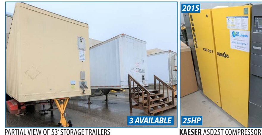
PARTIAL VIEW OF 53' STORAGE TRAILERS