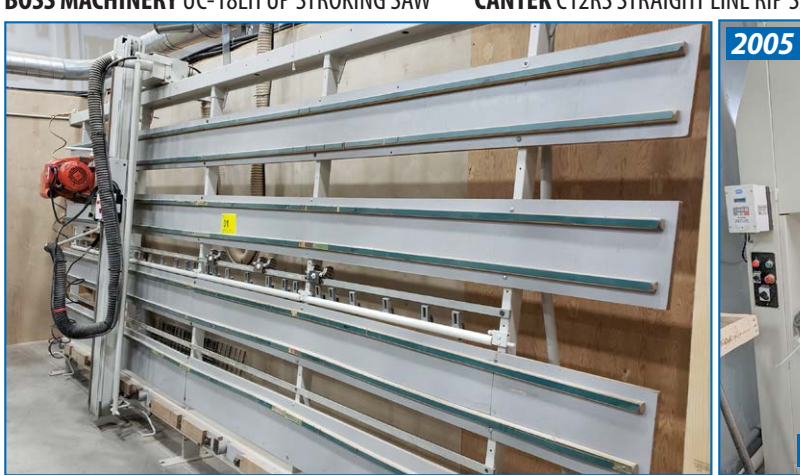
HOLZHER 1205 PANEL SAW