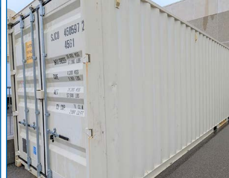
PARTIAL VIEW OF SEACANS