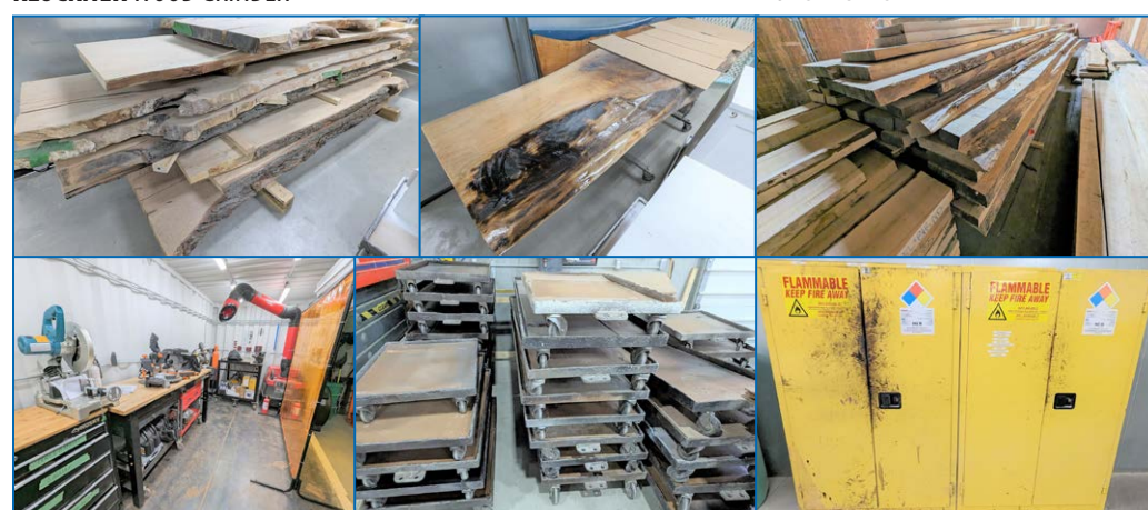
PARTIAL VIEW OF LIVE EDGE SLABS, RAW MATERIALS, PLANT SUPPORT