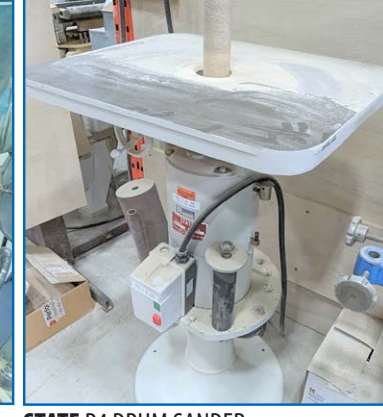
STATE P4 DRUM SANDER