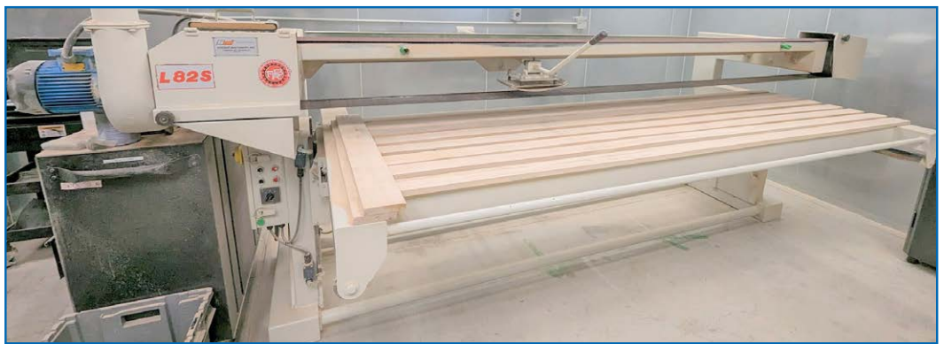
CONSTRUZIONI L82S STROKE SANDER