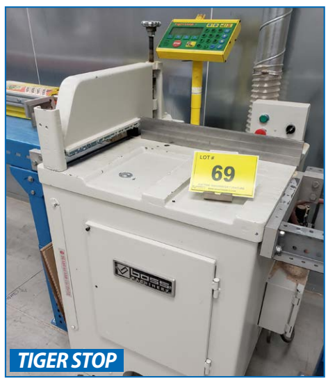
BOSS MACHINERY UC-18LH UP STROKING SAW