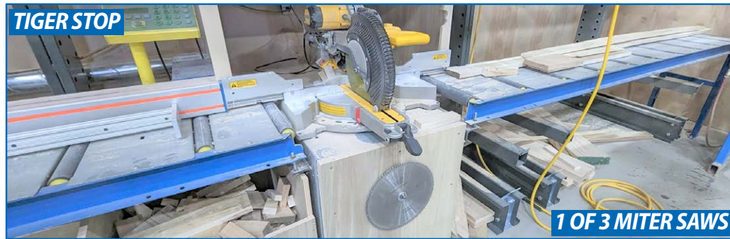
DEWALT MITER SAW