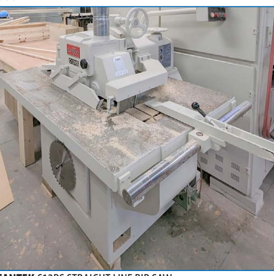
CANTEK C12RS STRAIGHT LINE RIP SAW