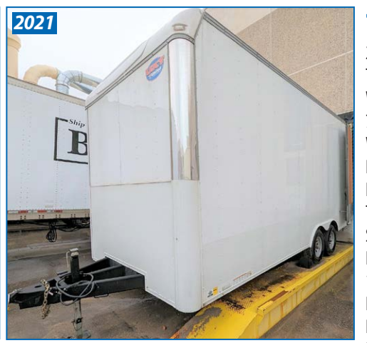
UNITED TANDEM AXEL ENCLOSED TRAILER