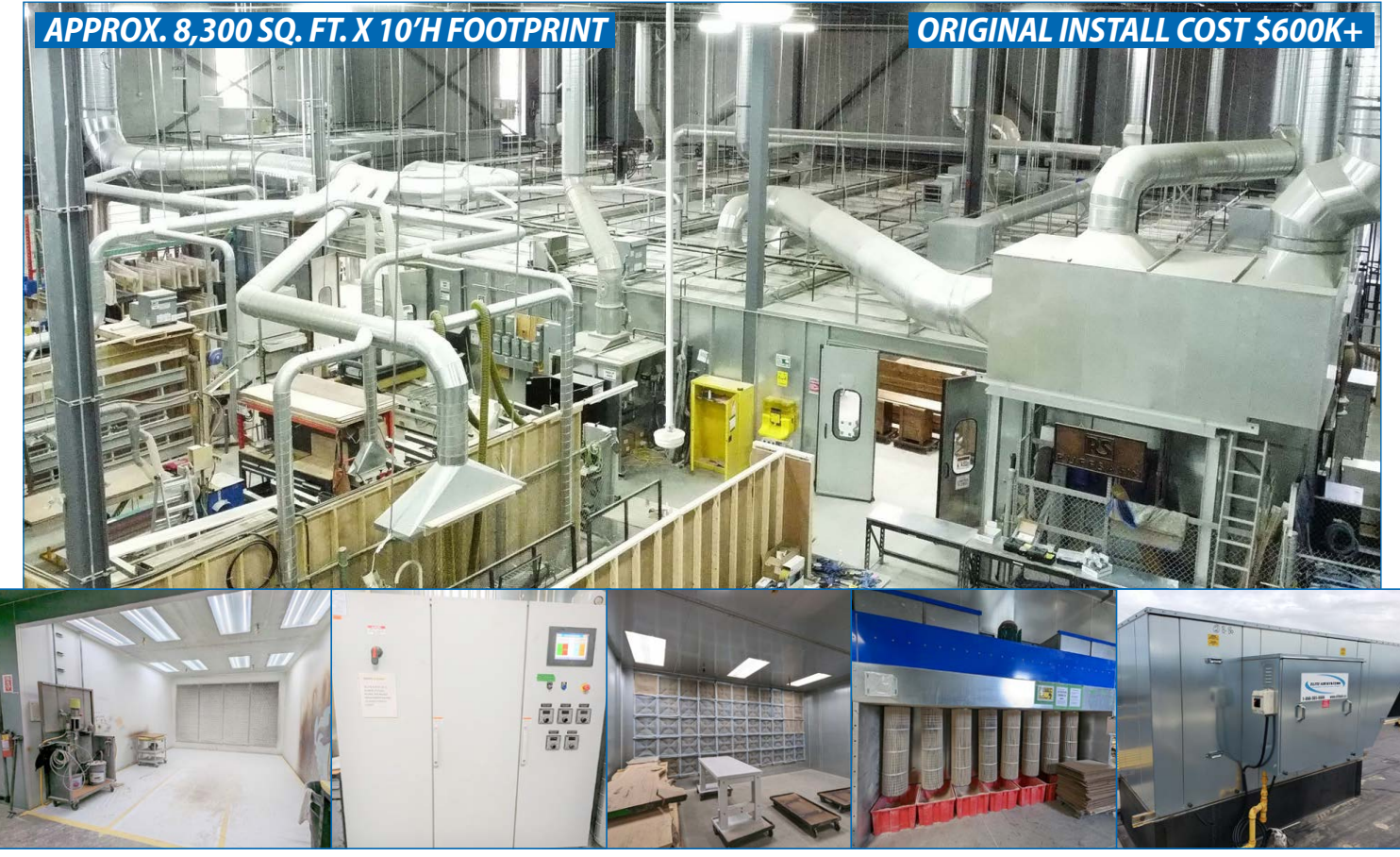
ELITE AIR SYSTEMS CUSTOM FREE STANDING SPRAY BOOTH