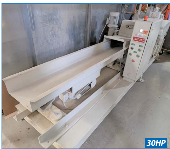
KLOCKNER WOOD GRINDER